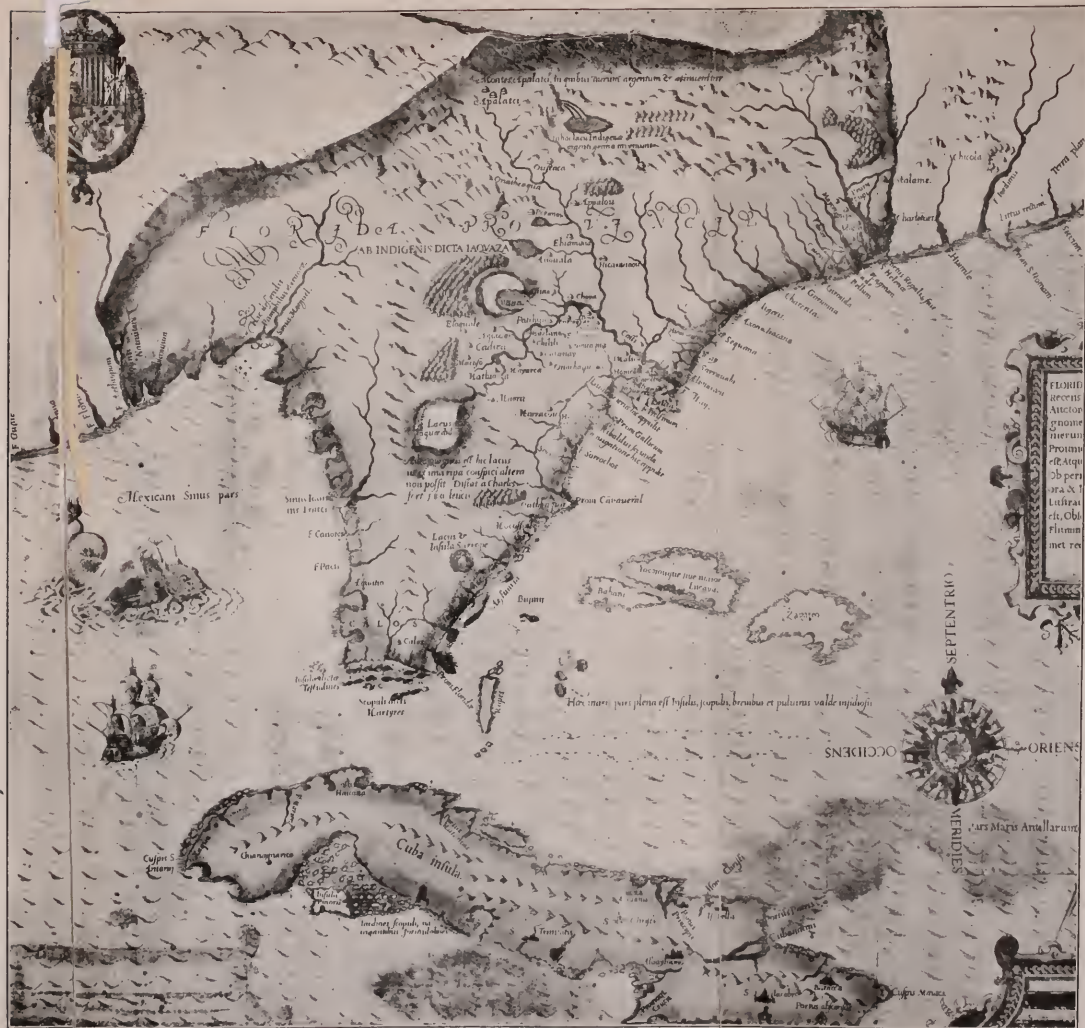
"FLORIDÆ AMERICANÆ PROVINCIAE RECENS & EXACTISSIMA DESCRIPTIO," BY JACQUES LE MOYNE DE MORGUES, PUBLISHED BY DE BRY IN 1591.