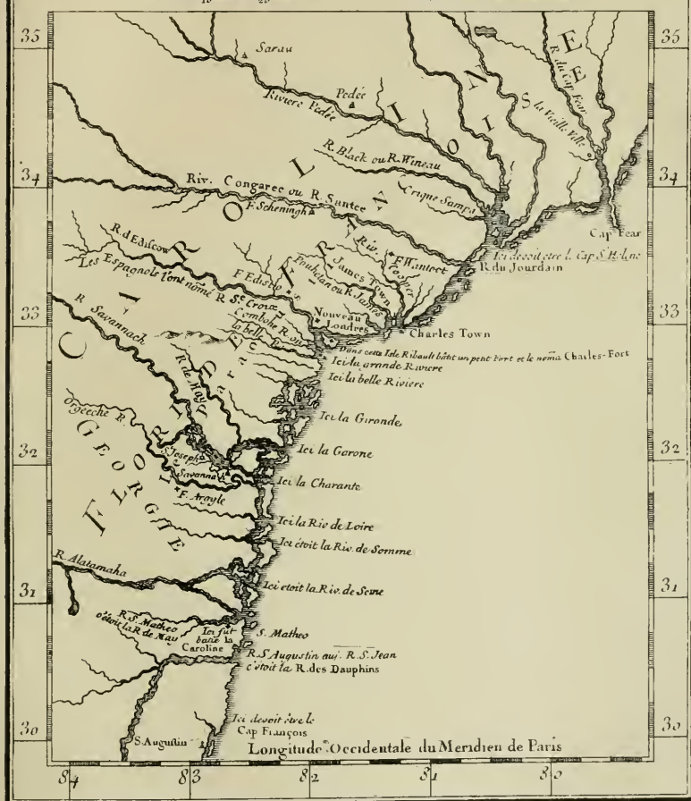
MAP OF THE FRENCH FLORIDA COLONY OF 1562-65, BY NICOLAS BELLIN, IN "HISTOIRE ET DESCRIPTION GÉNÉRALE DE LA NOUVELLE FRANCE," PAR LE P. DE CHARLEVOIX, PARIS, 1744.